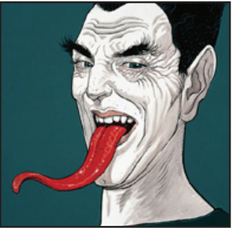
Moebius Artist – The Incal