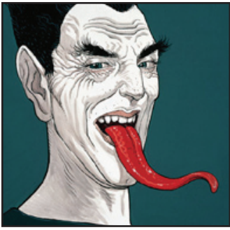
Alejandro Jodorowsky Author – The Incal

Brian Michael Bendis ( Ultimate Marvel, Secret Invasion ) on The Incal : “ I didn’t buy clothes so I could buy graphic novels by Moebius. To the authors...thank you for literally decades of inspiration and showing all my peers and me what the graphic novel is capable of. ”